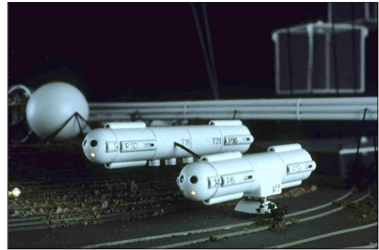
Figure 1 Slide image from Hydrospace project showing mineral gathering (foreground), petroleum pipelines (near background), and fish farm containment structures (background).

tion. At the end, the "grand concept" addressed a wide range of problems with an integrated, multi-component solution. Figure 1, from a slide presentation, shows some of the system's components.